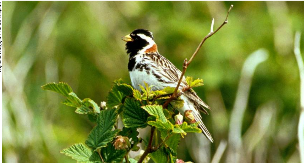
Lupland Longspur/James Leupold

Grasslands are among the most threatened habitats on earth and are under-represented in protected area systems. The grasslands of North America are no exception and their disappearance has led to equally severe declines in the bird species that inhabit them, many of which are endemic. Grassland birds and their habitats span the continent; therefore, their conservation depends on coordinated action in Mexico, the United States, and Canada.