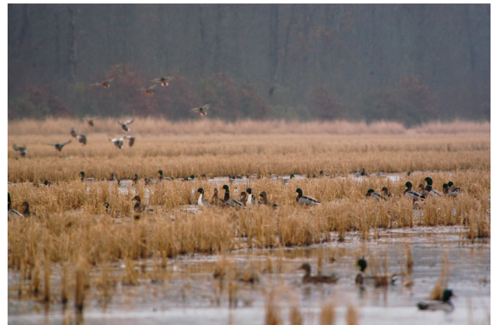
Flooded rice fields in Arkansas benefit birds and farmers. Mike Checkett

Human dimensions research can maximize limited financial and staff capacity by supporting the design of conservation programs that work with and for people. Such information can aid practitioners in determining the best ways to motivate and engage citizens to care about and support bird conservation.