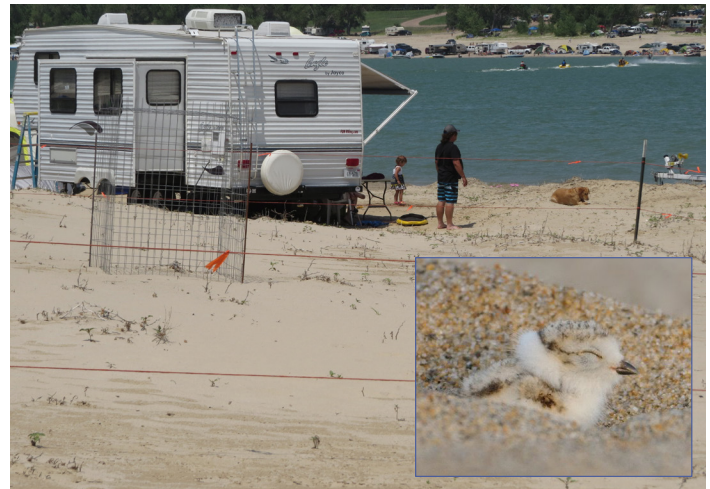
Recreationists enjoying Lake McConaughy in Nebraska next to a Piping Plover nest. Inset photo: Piping Plover.

Along with increased enforcement, human dimensions research influenced how park staff and agency personnel communicated with visitors about pet and human safety to