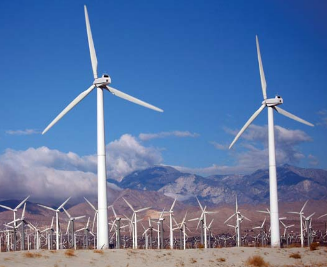
JOSHUA WINCHELL / USFWS