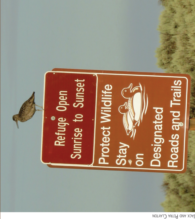
JACK AND PETRA CLAYTON

Priority Action: Work with private agricultural landowners to implement grazing strategies that meet the economic bottom line for agriculture while promoting healthy bird and other wildlife populations.