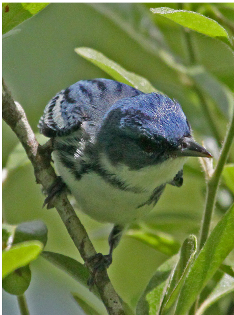
Cerulean warblers benefit from NMBCA funding that helps to protect critical habitat in Colombia