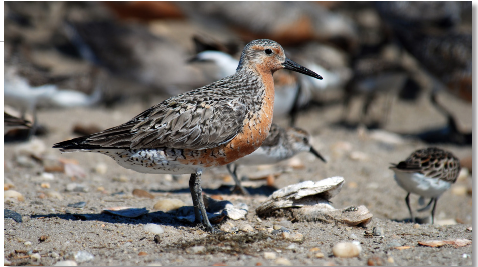
Red Knots are one of 386 Neotropical migratory species that benefit from NMBCA.