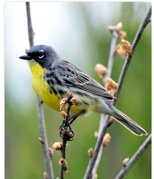
The Kirtland's warbler is another beneficiary of NMBCA funding.

Grants fund a broad array of efforts to conserve these and other threatened habitats including securing, restoring, and managing habitat; conducting law enforcement activities; providing community outreach and education; and supporting population research and monitoring.