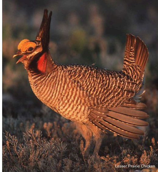
Lesser Prairie Chicken

U.S. NABCI is committed to integrating human dimensions (i.e., the many elements of conservation that are not wildlife and habitats) and conservation social science (i.e., scientific disciplines which explore human dimensions or integrate aspects of wildlife, habitats, and human behavior or social processes) into the work we do. As conservation is a human activity, a focus on human behavior and social processes, whether in the form of scientific research or public engagement, is necessary. Wildlife, habitats, and people are not always thought of together when we plan, manage, or study bird conservation even though they are inseparable. Comparable to biological information, human dimensions information can be a valuable addition to every phase of conservation work, from research and planning to design, delivery, monitoring, and evaluation. U.S. NABCI supports the intentional integration